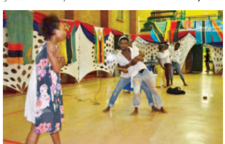
Diverse actors performing diverse acts.