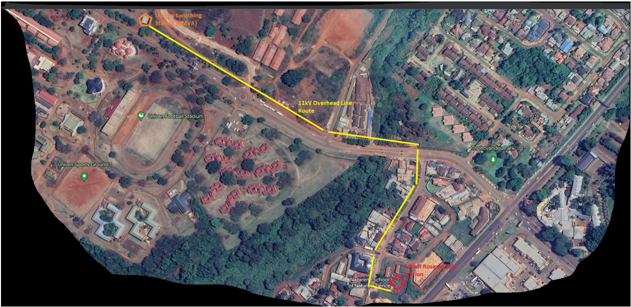
Figure 3: Eskom Connection