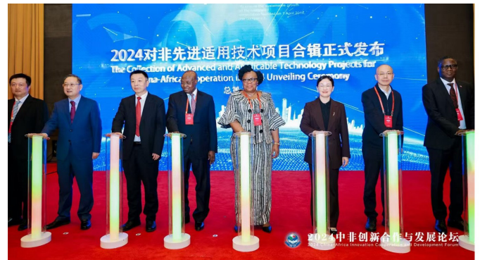
Advanced applicable technology projects for China-Africa Cooperation 2024 unveiling ceremony

As UNIVEN continues to build on its partnerships in China, it is positioning itself as a leader in green technology and sustainable development. The university's participation in these international forums reflects its commitment to advancing research, fostering innovation, and contributing to the global knowledge economy.