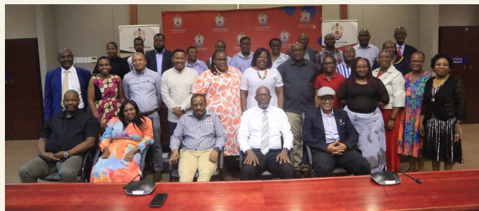
A group photo of DHET delegates with UNIVEN staff members at Research Conference Centre

The visit concluded with an emphasis on the collaborative effort between DHET and UNIVEN to ensure that the objectives of the Sibusiso Bengu Development Programme are met, ultimately advancing the broader goals of higher education transformation in South Africa.