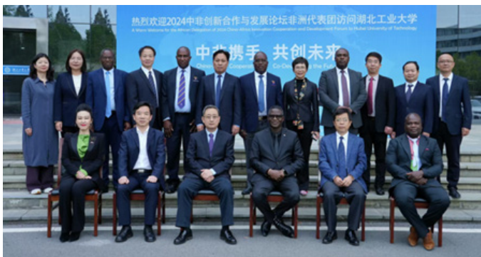
GTCI Inaugural Council meeting