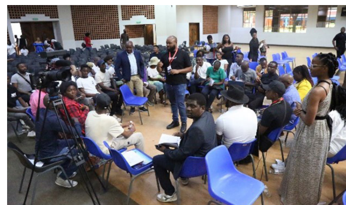
On Photo: Graduates and Entrepreneurs during the breakaway sessions with guest speakers