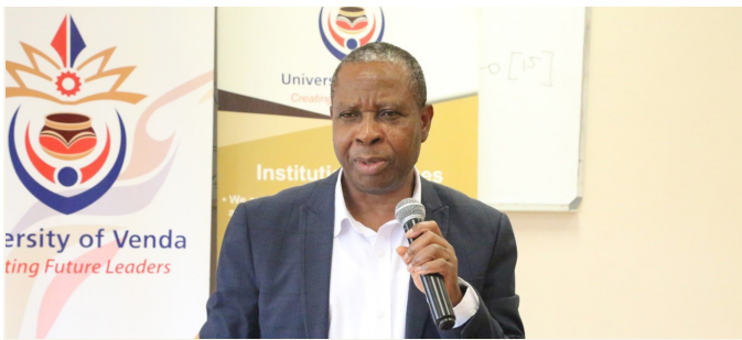
On Photo: Director International Relations and Partnerships