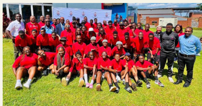
Group photo of attendees