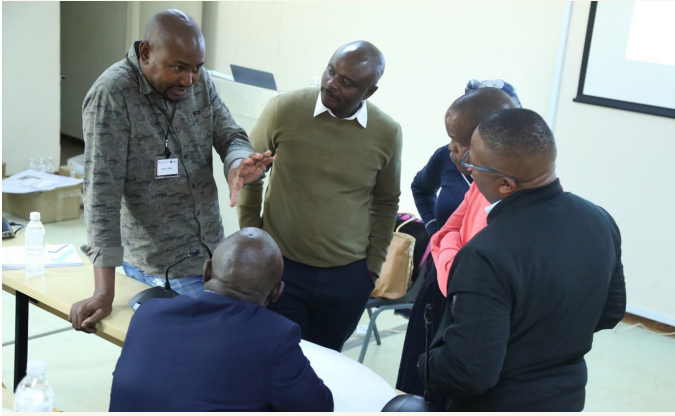
A group of participants sharing ideas

During these three days, the programme balanced deep reflection, practical tools, and peer learning. Through group discussions, case studies, and personal storytelling, participants were not just gaining knowledge; they were reshaping how they lead.