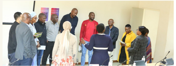
Participants reflecting on their leadership skills through pictures

As this second cohort completes its transformative journey, the University of Venda reaffirms its commitment to developing visionary, values-driven leaders. With the support of esteemed partners like the UCT Graduate School of Business, the MDP continues to shape a resilient, capable, and forward-looking leadership community.